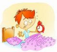
In the morning, Mick wakes up at nine o'clock.