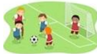
In the afternoon, he plays football with his friends.