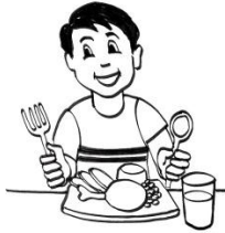
At noon, he eats lunch.

Q1. Number the pictures in the correct order (1,2,3,4) to make a story.